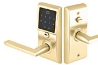
EMTouch™ Keypad Leverset