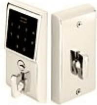
EMTouch™ Keypad Deadbolt