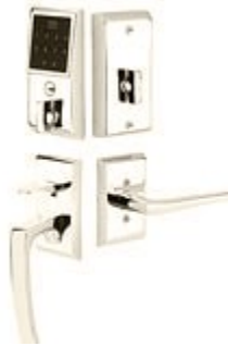
EMTouch™ Keypad Entryset